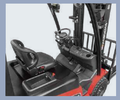
Fully closed operation plate space, tilting cylinder and flat bottom plate, providing mor comfortable and safe operation