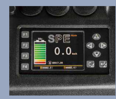
Multi-function instrument with color screen, clear human-computer interaction interface for visualized reading.