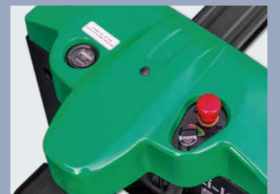
Body feature smooth lines and affluent sense of movement, and compact profile, in accord with the latest appearance design trend