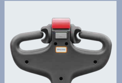
The upright-tiller running function allows it to work within confined space, such as container