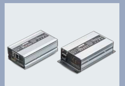
The charger has compact body and is easy for carry