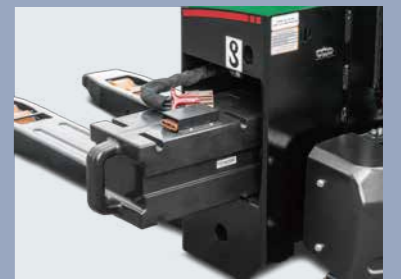
Easy for exchanging battery