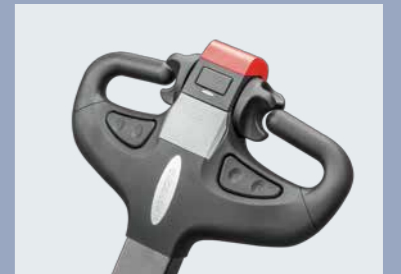
The modular tiller is simple but reliable and beautiful, all parts inside it can be replaced separately and all operations can be done easily with one hand